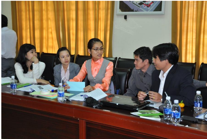
Figure 1: Group discussion of climate change effect to forestry and agriculture