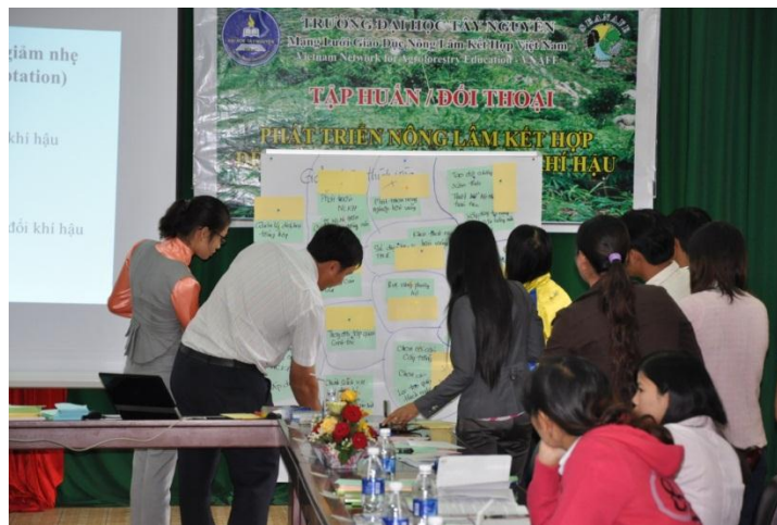
Figure 3. Votes for adaptation solutions