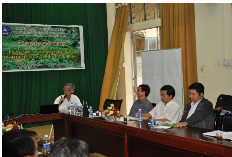
Figure 5. Dialogue session